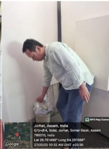
Jorhat, Assam, India Q7j+jh4, Sotal, Jorhat, Somar Gaon, Assam 785010, India Lat 26.781498° Long 94.291666° 27/05/2025 10:32 AM GMT +05:30