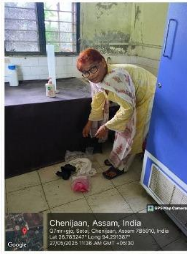
Chenijaan, Assam, India Q7m+glo, Sotal, Chenijaan, Assam 785010, India Lat 26.783242° Long 94.291387° 27/05/2025 11:36 AM GMT +05:30