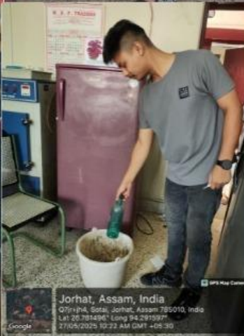
Jorhat, Assam, India Q7j+jh4, Sotal, Jorhat, Somar Gaon, Assam 785010, India Lat 26.781498° Long 94.291597° 27/05/2025 10:23 AM GMT +05:30