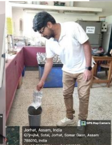
Jorhat, Assam, India Q7j+jh4, Sotal, Jorhat, Somar Gaon, Assam 785010, India