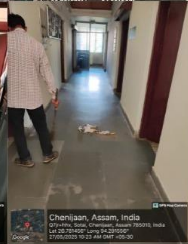
Chenijaan, Assam, India Q7j+hhk, Sotal, Chenijaan, Assam 785010, India Lat 26.781456° Long 94.291556° 27/05/2025 10:23 AM GMT +05:30