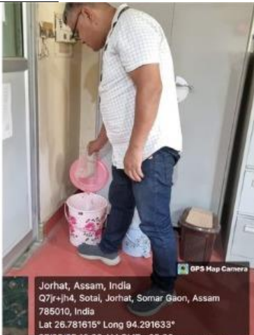
Jorhat, Assam, India Q7j+jh4, Sotal, Jorhat, Somar Gaon, Assam 785010, India Lat 26.781615° Long 94.291633° 27/05/2025 10:33 AM GMT +05:30