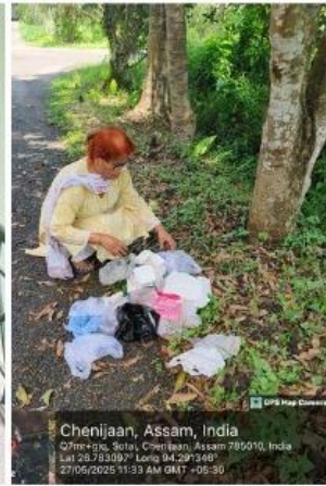
Chenijaan, Assam, India Q7m+glo, Sotal, Chenijaan, Assam 785010, India Lat 26.783242° Long 94.291387° 27/05/2025 11:33 AM GMT +05:30