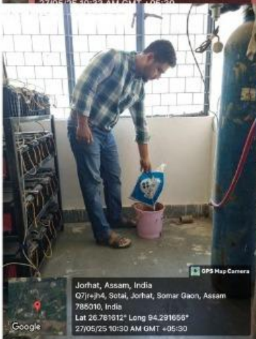
Jorhat, Assam, India Q7j+jh4, Sotal, Jorhat, Somar Gaon, Assam 785010, India Lat 26.781612° Long 94.291656° 27/05/2025 10:30 AM GMT +05:30